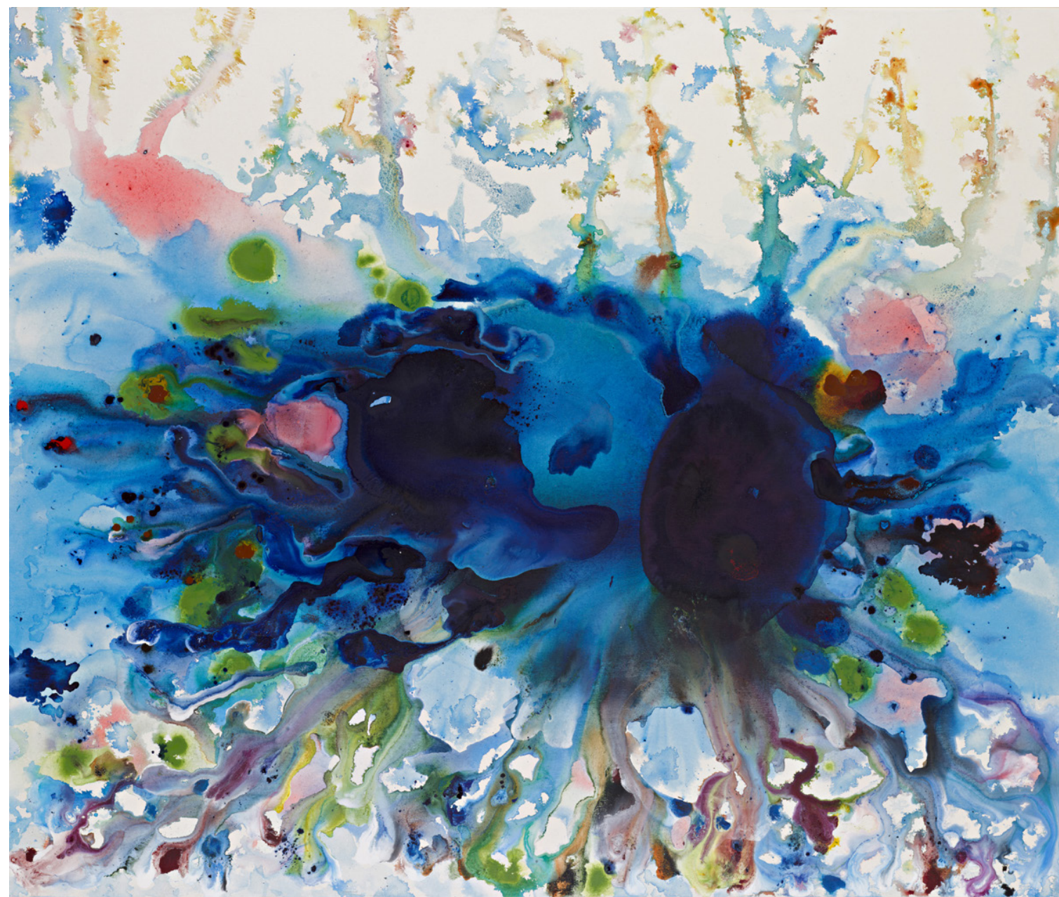
Reef, 2010, Diluted acrylic on canvas, 60 x 70 in,