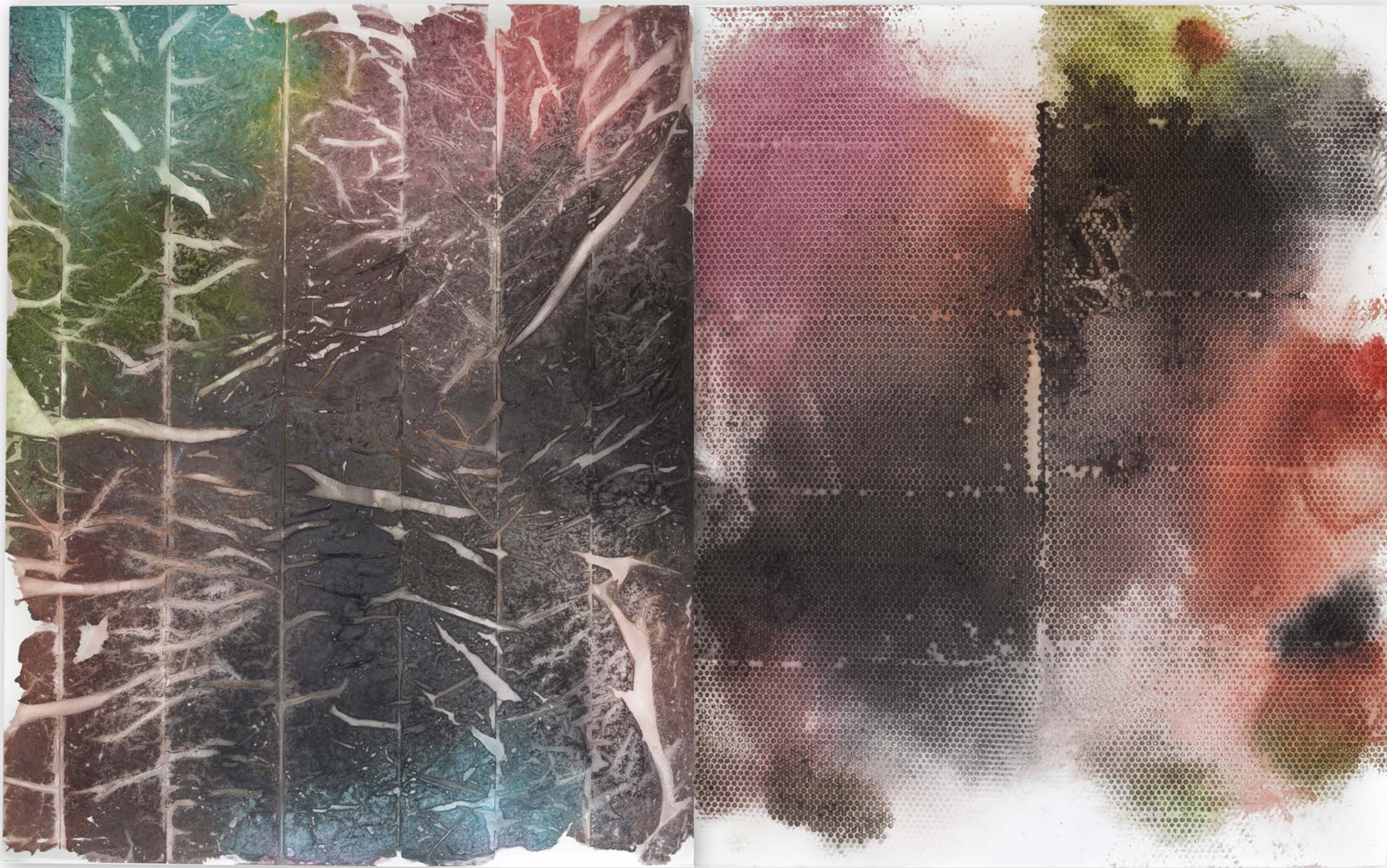
Velvet Duo, 2015, Diluted acrylic on canvas, 60 x 96.5 in. (diptych)