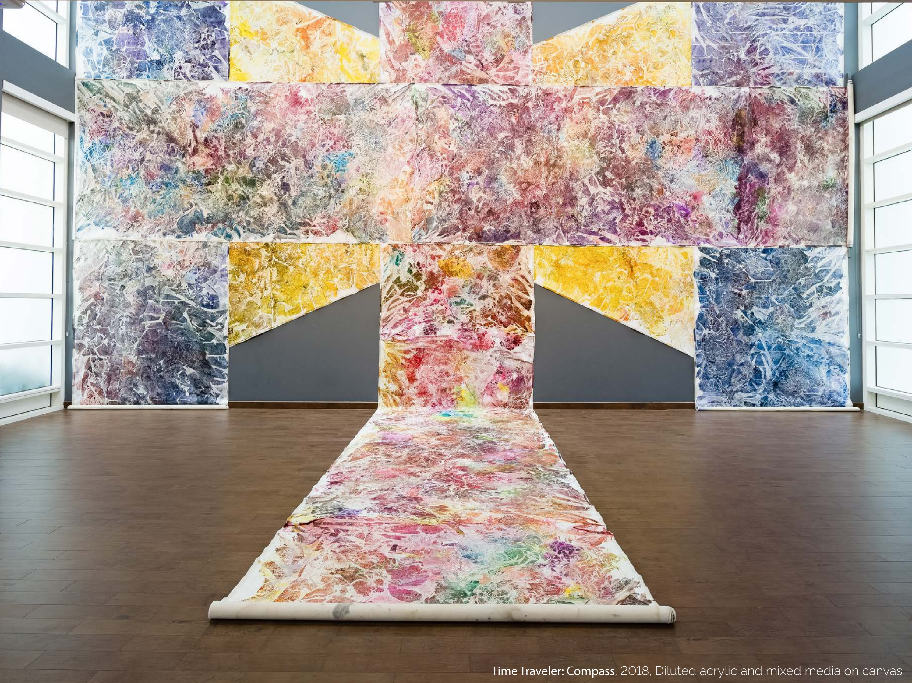
Time Traveler: Compass, 2018, Diluted acrylic and mixed media on canvas